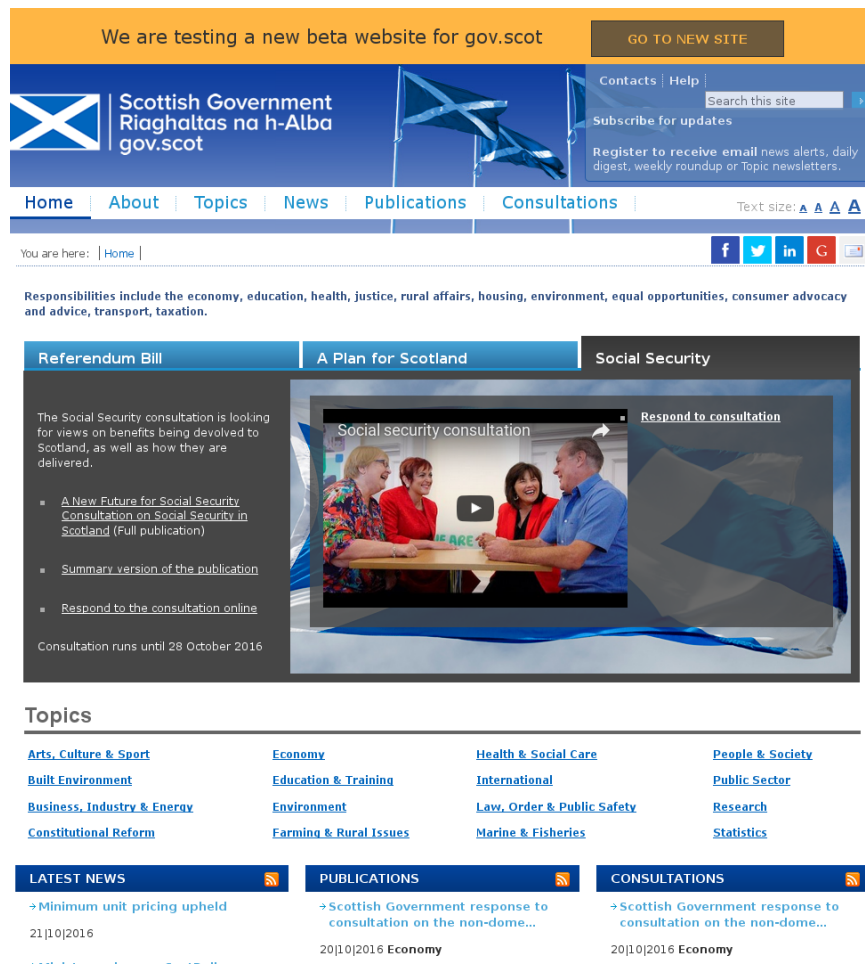
Figure 2: Scottish government web page.