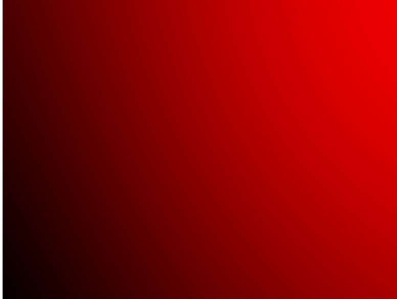
Figure 1: Starting point